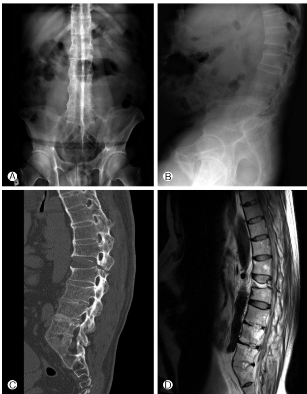
Fig. 1. Preoperative images of the patient. A 42-year-old male AS patient slipped down on icy roads and suffered from an unstable L2 burst fracture. (A) Anteroposterior plain radiography image which demonstrate L2 burst fracture and bamboo spine. (B) Lateral plain radiography image which demonstrate L2 burst fracture and bamboo spine. (C) Lateral image on computed tomography shows transcorporeal fracture. (D) T2 magnetic resonance image shows three column injury.

Preoperative evaluation was done for general anesthesia. He had cardiovascular and pulmonary disease; aortic regurgitation, mitral valve disease and fibrous disease in the lung